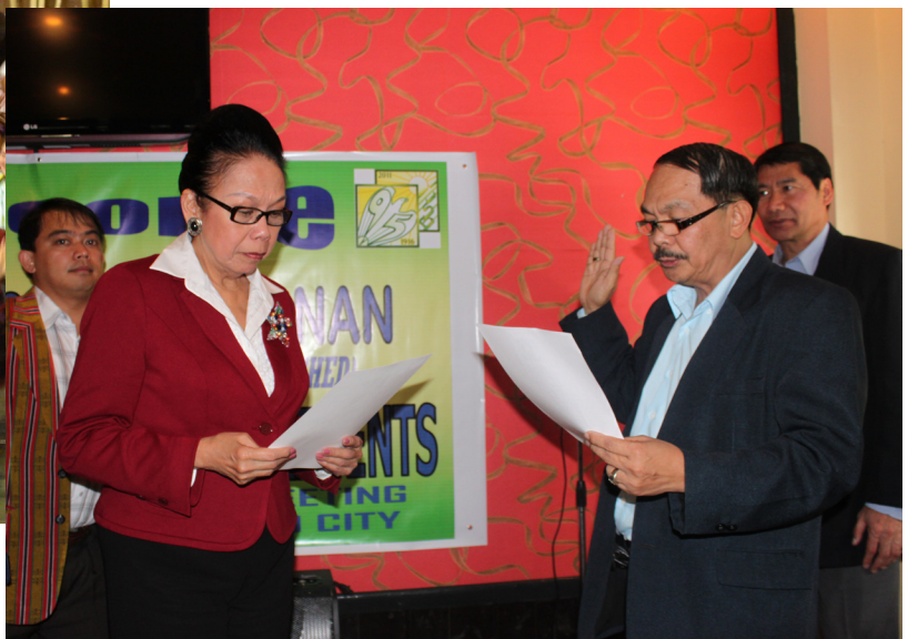
Bringing Service with Utmost Quality & Dedication